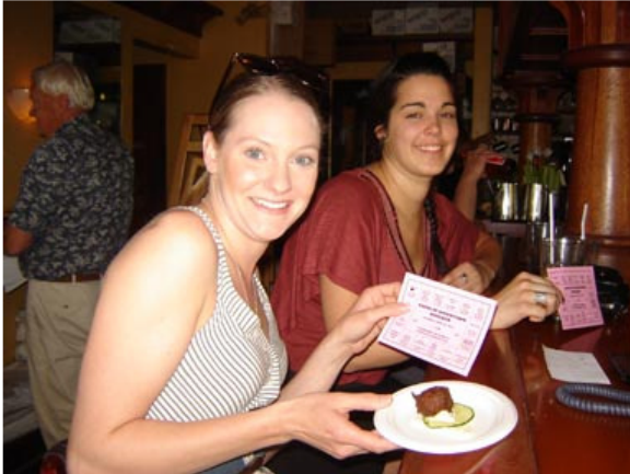
Falafels at Boulder Café

On a beautiful spring day, this year's Taste of Downtown Boulder ticket-holders enjoyed tasty food samples offered by 14 Pearl Street Mall area restaurants, including Boulder Café, Chipolte Mexican Grill, Hapa Sushi, Khow Thai Café, Linsay's Boulder Deli, Nick N Wily's Pizza, Old Chicago, Rib, Rio Grande, Rocky Mountain Chocolate, Smooch Frozen Yogurt, Spruce Confections, Woody Creek Bakery, and Zoe Ma Ma. Proceeds from Taste ticket sales will go towards funding Foothills Kiwanis Foundation projects for this current club year. Thanks to Pete Sprenkle for again serving as project leader for our Taste of Downtown Boulder fundraiser!