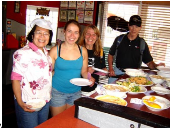
Many delicious Thai food samples at Khow Thai Café