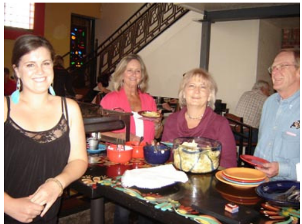
Taste ticket holder enjoy Mexican food at Rio Grande