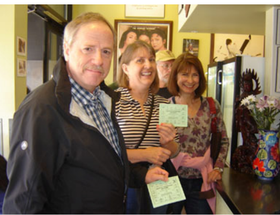
Taste participants at Zoe Ma Ma

Our club's "Taste of Downtown Boulder" fundraiser on Saturday, April 19 from 1-4 p.m. was blessed with nice weather that turned into showers just after the event ended. Most of the restaurants I contacted were very pleased with a good-sized crowd of Taste participants, and were happy for a successful fundraising event. While I've not heard from several club members, I estimate that the total ticket sales will be about 270; and total funds raised for our Foothills Kiwanis Foundation to be about $3000. Thanks to everyone for your help in making this year's Taste a success, and for making it one of the more fun Foothills Kiwanis events of the year.