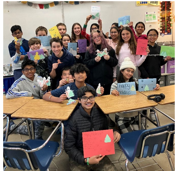
Students display their colorful cards