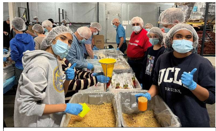
Volunteers of all ages packaging meal kits

It was such a pleasure to meet you today. Thank you for the great turnout and support today, and for all the past times that your church family and Kiwanis have supported Colorado Feeding Kids (CFK) team. I personally look forward to many more interactions between CFK and Risen Savior Lutheran Church.