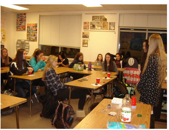
Monarch Key Club meeting on Thursday, October 22