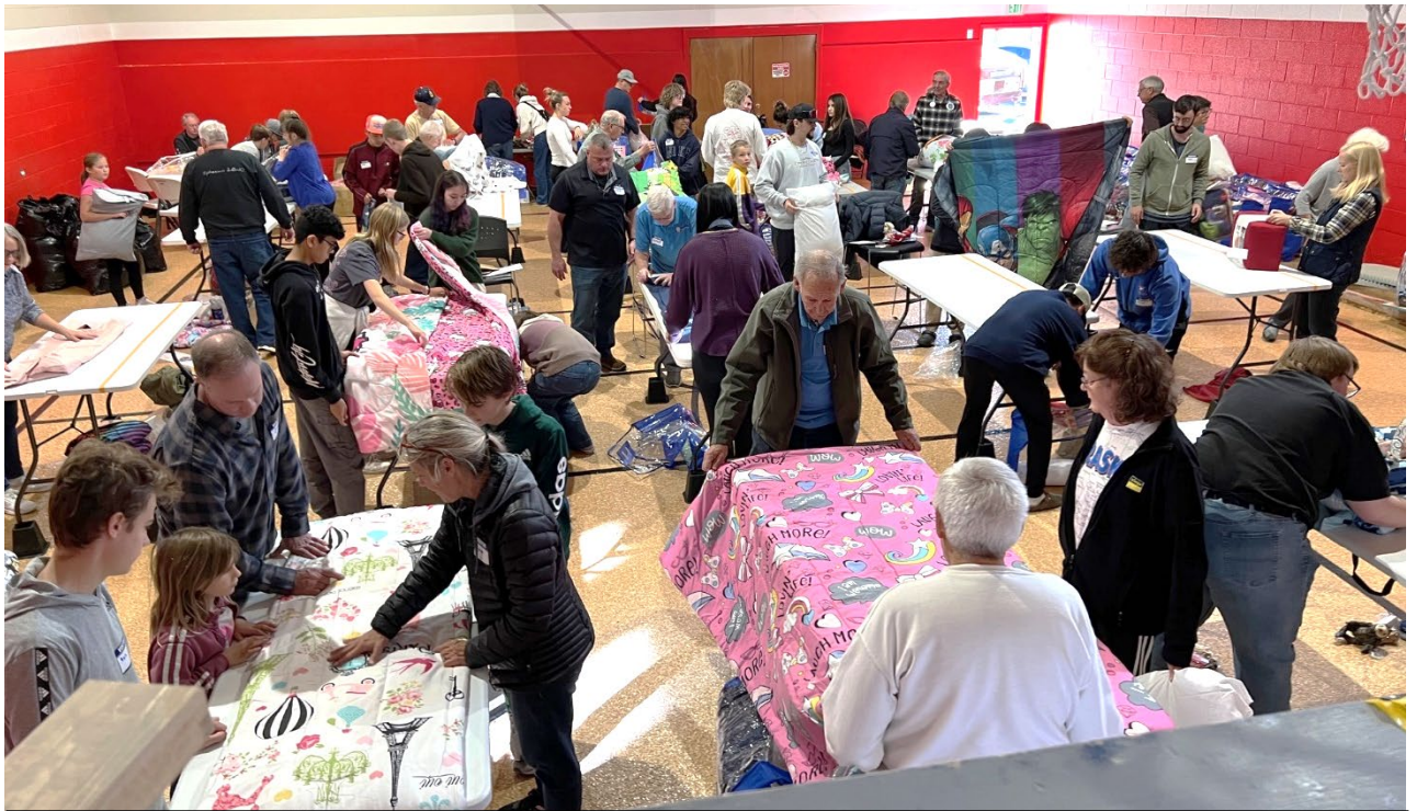
Many hands make light work – the group finished 100 kits in less than three hours!