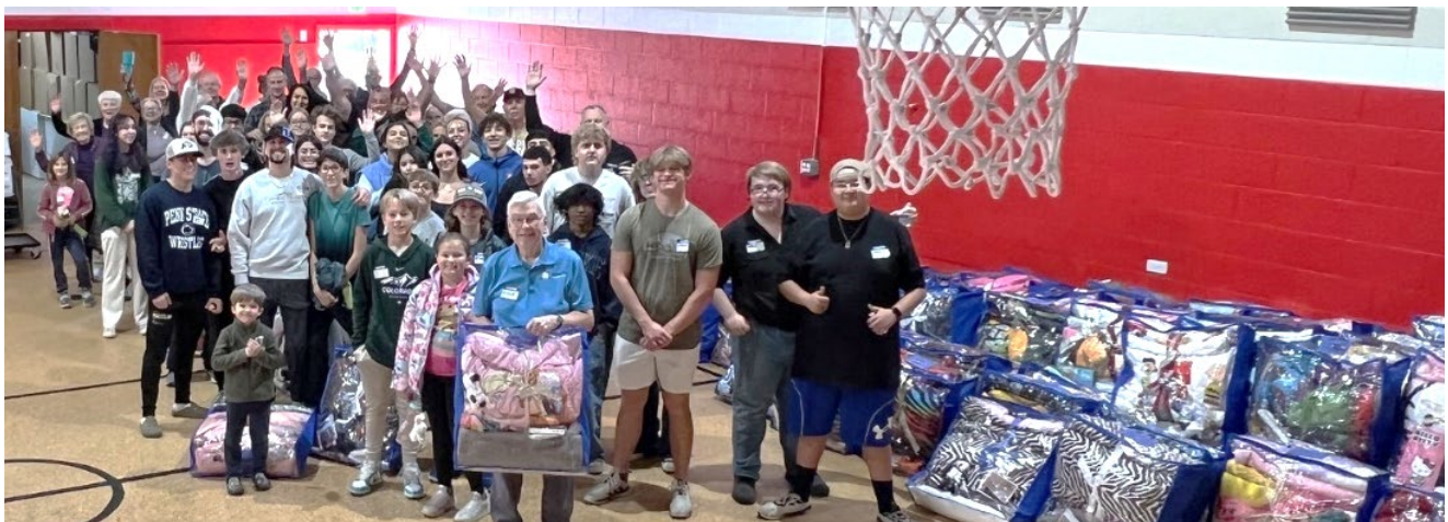
Group photo of the 60 volunteers in The Salvation Army gym with the finished bedding kits

KIWANIS: Serving the Children of the World!