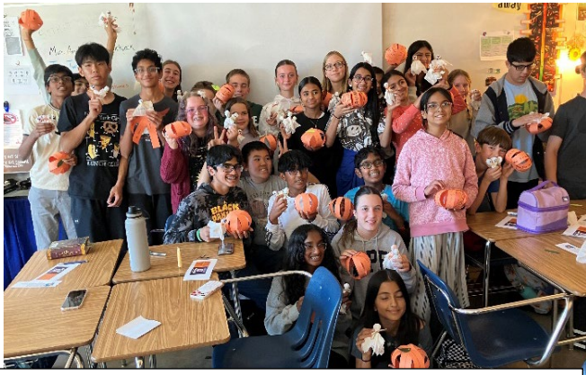
Club members with their gratitude pumpkins