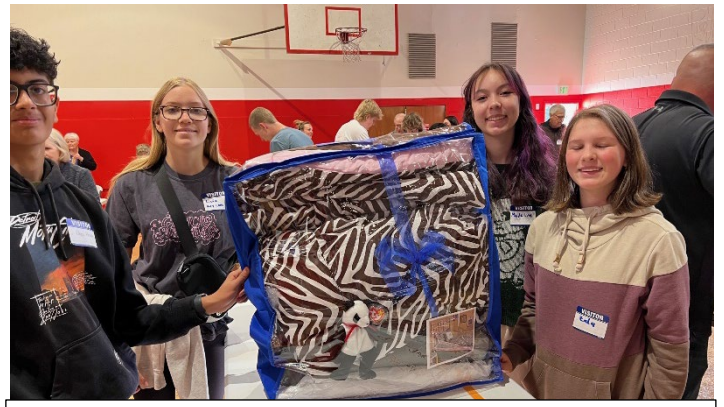
Peak to Peak Key Club members with finished kit