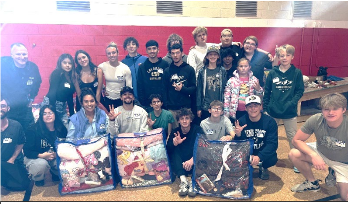
Young Life had a large turnout of volunteers