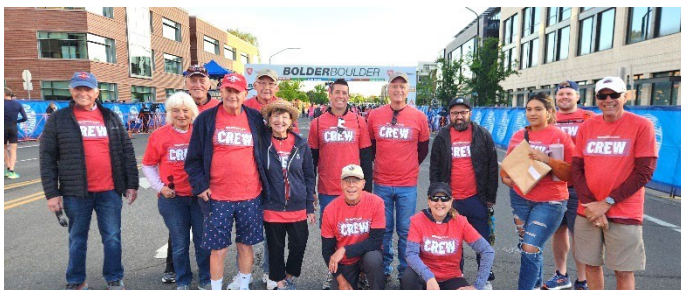
Our Kiwanis volunteers at the Starting Line

The Bolder Boulder was a great event once again. We had approximately 18 volunteers show up, representing Kiwanis of