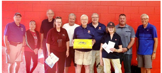
Our Kiwanis and Advisory Council volunteers